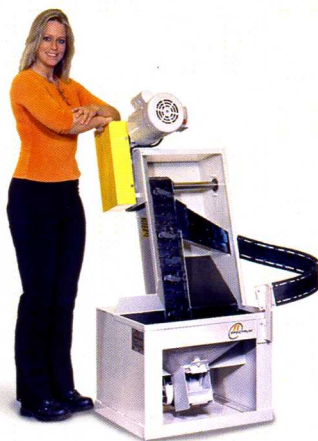
Conveyor Elevator Gravity Orienter