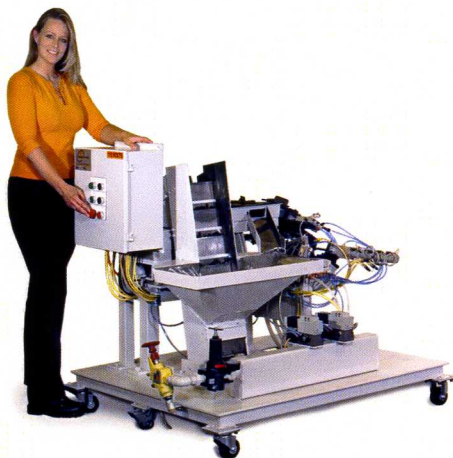
Stepper Elevator Vibratory Orienter